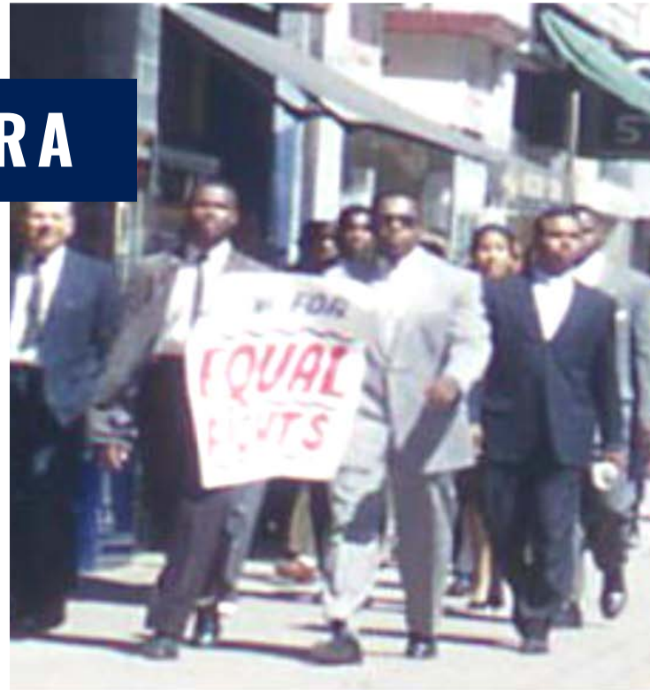
1960s. Approximately 2000 citizens marched through downtown Baton Rouge to protest the arrest of 23 Southern University students who staged sit-ins to protest lunch counters who refused to serve African-Americans.

Baton Rouge Black residents experienced unequal treatment for centuries but maintained the belief that change was possible.