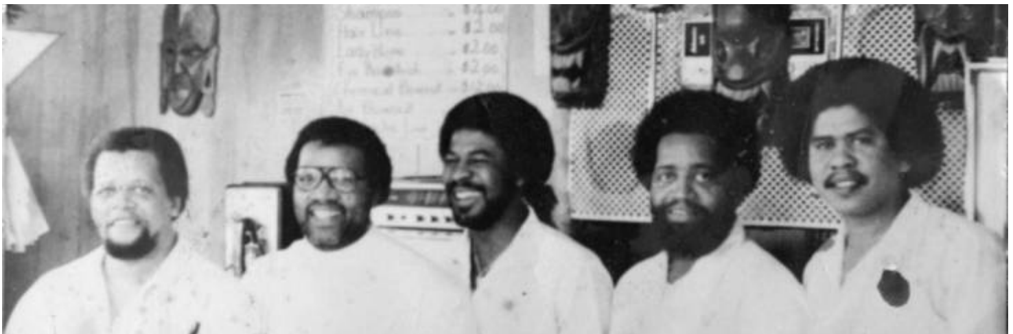
c. 1960 Barbers at Webb's Barber Shop located in South Baton Rouge. Webb's opened in the early 1900s and continues to provide services today.

In the decades after the Civil War, Baton Rouge never exceeded its pre-war population of roughly 5000. All of that changed when Standard Oil (now Exxon) arrived in Baton Rouge and opened its oil refinery in April of 1909. In January 1919, The Lamp – Standard Oil's nationally circulated trade publication- wrote glowingly about the refinery as a replacement to the area's cotton fields and primitive slave economy. It declared the refinery "an agent of Post-Reconstruction reconciliation" uniting northern