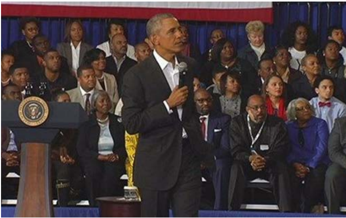
In 2016, then President Barack Obama held a town-hall meeting at McKinley High School that included students, parents, teachers, elected officials and community members.

presidential visit adds another layer of pride to Black residents of Baton Rouge. South Baton Rouge hosted the nation's first Black president in January 2016. Of all the places in the world the president could have chosen, he chose to meet the predominantly Black residents of South Baton Rouge in one of the first places Blacks could receive a high school education in all of Southern Louisiana. He chose to visit the site of the nation's first bus boycott. A place many residents of the region only drive through on their way from home in the suburbs to work and back was chosen by the president for a town hall meeting during his last year in office. Louisiana has hosted many presidents and presidential hopefuls. Area residents from across Baton Rouge braved cold temperatures waiting in long lines at McKinley High School Alumni Center for a limited number of free tickets to hear President Obama speak in the gymnasium of the current McKinley Senior High School.