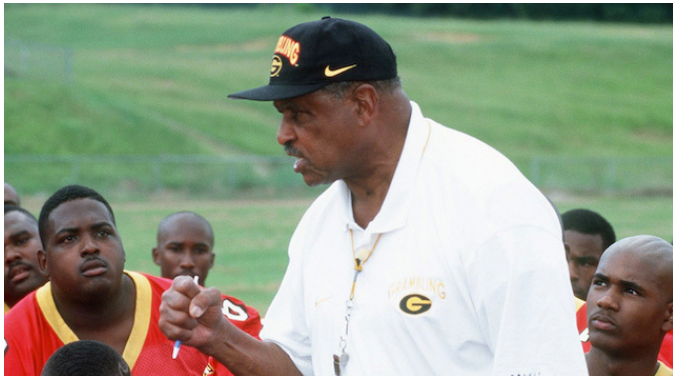
Coach Eddie Robinson, Sr. broke barriers to become one of the winningest coaches in college football history. His legacy reached beyond the football field; he now has a street named after him, a museum celebrating his achievements and countless players and fans with loving stories to share.

quarterback. Robinson wanted to coach after his college career, but coaching opportunities were few and far between. Robinson found a job working in a feed mill in Baton Rouge. He soon became aware of an opening for a football coach at Louisiana NegroNormal and Industrial Institute, which later became Grambling University. Robinson's coaching career began in 1941 and the rest is history. The McKinley High School graduate coached more than 200 players who went on to play in the NFL. Doug Williams, a Super Bowl champion, is just one of the professional players Robinson coached over the course of his career. By October 7, 1995, he became the first college football coach to break the 400- win barrier.