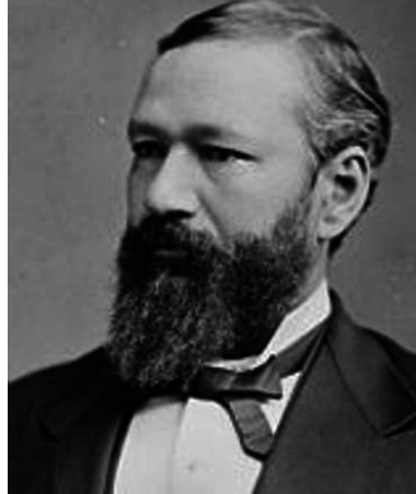
Gov. Pinckney Benton Stewart (P.B.S.) Pinchback was the first Black governor of Louisiana. Elected during reconstruction, Pinchback served for one year, but was later elected to the U.S. Senate

of white supremacy and the end of Reconstruction through the removal of federal troops – regained control of the state legislature. Most Black citizens were totally disenfranchised by the new state constitution of 1898 and were excluded from politics for decades.