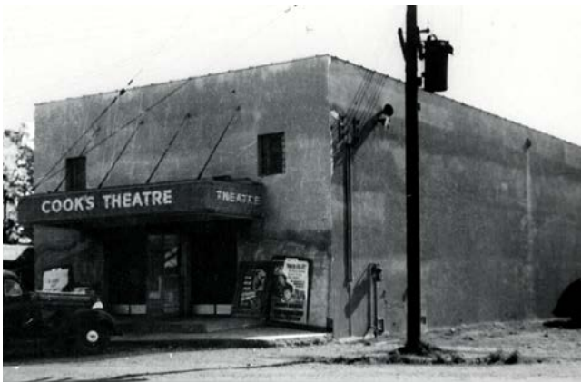
Opening in the mid 1930s, Cook's Theatre was the first Black owned theater in the city. The original structure was destroyed by fire in 1944 but was later rebuilt and served Black theatergoers for over 30 years

Black visitors and residents throughout the city stayed at Hotel Lincoln and took in shows at the historic Lincoln Theater. The theater, located on the corner of Eddie Robinson Sr. and Myrtle Drives, opened in 1949. It was one of three major Black theaters in Baton Rouge at the time. Movies were 75¢ then. The building also housed several Black-owned businesses, including insurance companies, a laundromat, and a barbershop. Efforts to restore the theater are continuing.