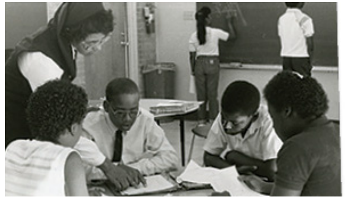
1987. Students at St. Francis Xavier Catholic School in Baton Rouge, the only African- American Catholic School in the Diocese of Baton Rouge.

St. Francis Xavier Catholic School is a fixture in South Baton Rouge. It is the only African American Catholic school