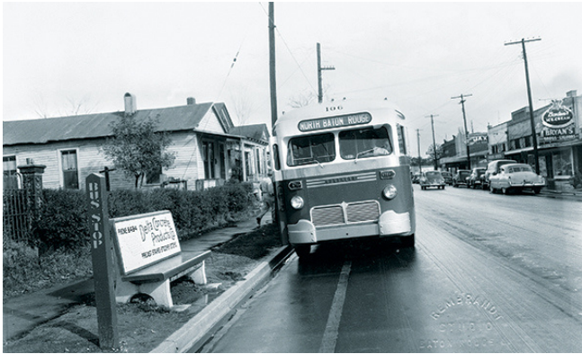
In 1953, two years before the famed Montgomery Bus Boycott led by Dr. Martin Luther King, Jr., Black Baton Rouge called for fair treatment while riding the city bus in the first bus boycott.

which relaxed Jim Crow segregation on the buses. The ordinance called for seating on a first come, first serve basis. The residents were successful in securing Ordinance 222. The ordinance stated Blacks were required to sit from the rear to the front, while whites had to sit from the front to the rear.