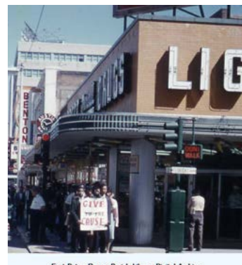
1960s. Protests to end racial discrimination at downtown lunch counters brought together over 2000 citizens. Shown here on the corner of Florida and Third St. passing Liggett's Drugstore.

In this section, we discuss the continued development of Baton Rouge and its influence of the Black community and its institutions. We examine the fight for social justice in Baton Rouge that in many ways mirrors the fight for social justice in other parts of the Deep South and the nation. Among the most notable examples of fights for equal treatment are the establishment of Brooks Park, the 1953 Baton Rouge bus boycott, the Kress sit-ins, and efforts to desegregate schools.