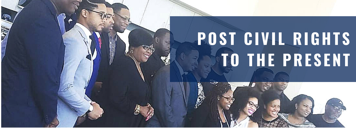
2016. The city's younger generation prepare to usher in change in Baton Rouge

After the end of the Civil Rights Movement, Black communities in Baton Rouge grew and experienced progress, even though racial tensions remained. From that moment until this, Black Baton Rouge continues to feel the effects of the past. In this section, we continue to examine school desegregation that shaped the development of the city and the surrounding areas. Next, notable Black figures of Baton Rouge and world politics are presented along with their impact on the Black community. Lastly, we provide a brief glimpse at the status of present-day Black Baton Rouge.