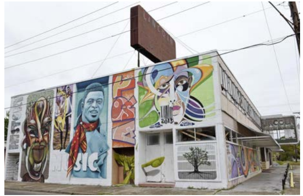
The Lincoln Theater was an important fixture in Black Baton Rouge. Remembered as one of the only places Black people could take in a movie, it also served as meeting space for Civil Rights groups. Residents continue efforts to preserve the history of and to restore the building. Shown here in 2018, murals adorn the exterior seemingly as a tribute to the artistry the building represents.

The upstairs rooms in the Lincoln Theater were used during the civil rights struggles in the 1950s. One longtime resident of South Baton Rouge reflected on the significance of the theater to the Black community. The resident recalled that the theater “had been our place, this was our salvation right here.” With the end of legal segregation in the city, “soon, one-by-one, things started to vanish, and so did the essence of the Lincoln. It was once