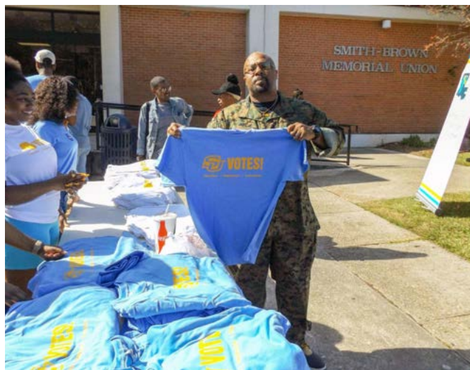
Students promote civic engagement in 2019 outside the Smith-Brown Memorial Union on the campus of Southern University. The student union was renamed for the two students who lost their lives during student protests on the campus.