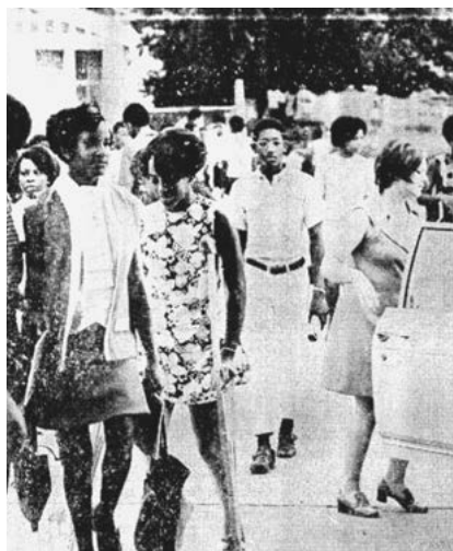
Black students and a white teacher arrive to McKinley High School in 1970 under a court-ordered desegregation plan.