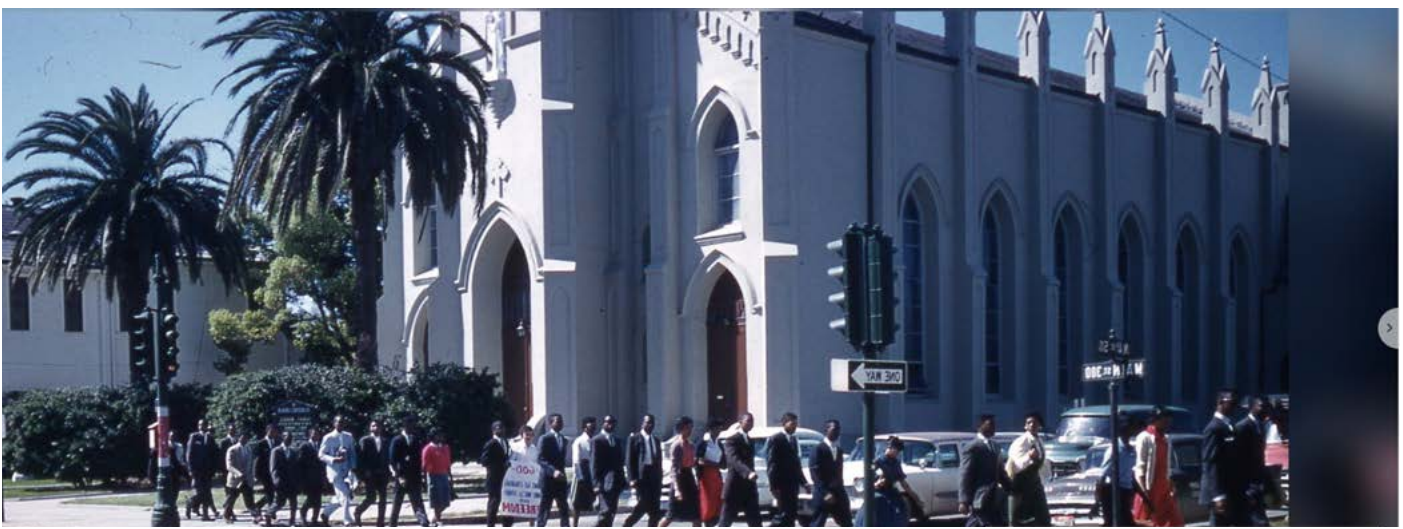
1960s. Calls for racial equality led to demonstrations and protests in downtown Baton Rouge.

February 1st student sit-in protests organized by Black college students in Greensboro, North Carolina.