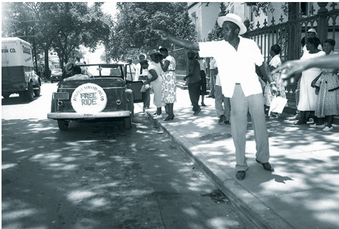
c. 1953 Black Baton Rougeans organized free carpools to allow those boycotting the bus system to still be able to meet daily responsibilities. This boycott served as a blueprint for the more well-known Bus Boycott in Alabama two years later.